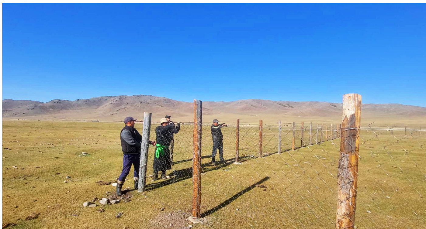
Darkhan Uul Bagh herders constructing a demo plot to show pasture recovery after adapting holistic management approach on rangeland management.