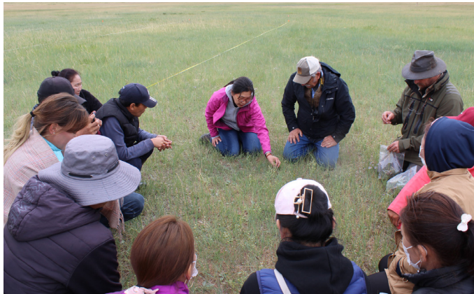
Land "reading" practical session

The Savory Institute experts conducted the