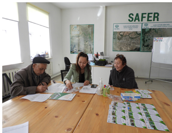
SAFER-2 project agronomist is with beneficiaries

Fifteen training gardens were also established with raised boxes and cold frames along with the distribution of seeds and tools for the 365 participants. The agricultural theory and practice trainings were also organized in accordance with the approved curriculum which is done in both Mongolian and Kazakh languages.