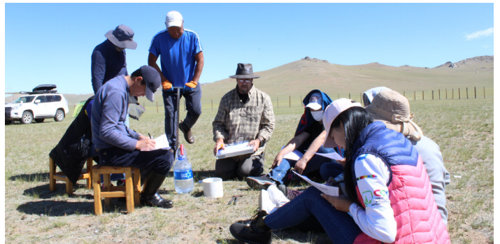
Taking soil samples