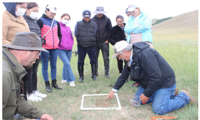
Ecological short term monitoring session

Examples of special projects include joint efforts with Heifer International in Senegal, with The Nature Conservancy in Colorado, and with ADRA in Mongolia. Savory Institute’s big audacious goal for 2025 is to establish 100 Hubs, setting the stage to influence management on 1 billion hectares of land and make a significant dent in carbon drawdown before it is too late. Through a growing global network and new programs in the pipeline to accelerate adoption, this goal is not just achievable, but necessary to create a livable planet for many generations to come.