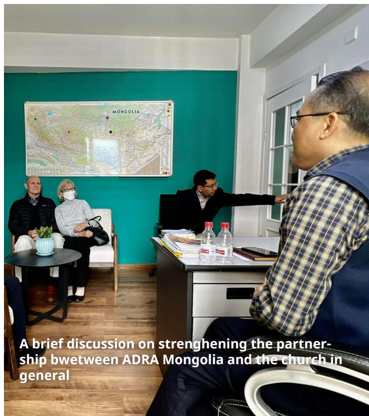
A brief discussion on strengthening the partnership between ADRA Mongolia and the church in general