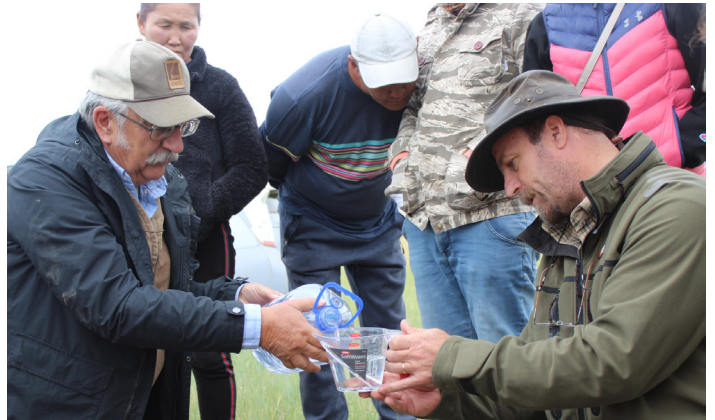
Water infiltration session