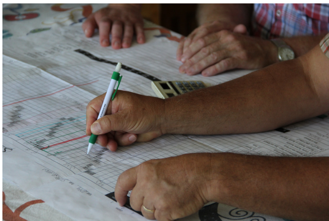
Pasture planning through holistic management

Ecological Outcome Verification (EOV) baseline practical training with hands-on field sessions that taught participants how to 'read' the land. They also conducted ecological monitoring for short-term indicators for some of the local government officials, herders, as well as ADRA staff.