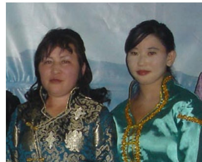
Winners of "Safe Choice" Debating competition

tugrug (approx $US72) was raised. Fundraising was carried out over the course of the concert series however it was insufficient to cover associated costs. The concerts were still considered a success due to the networking and knowledge sharing that was facilitated.