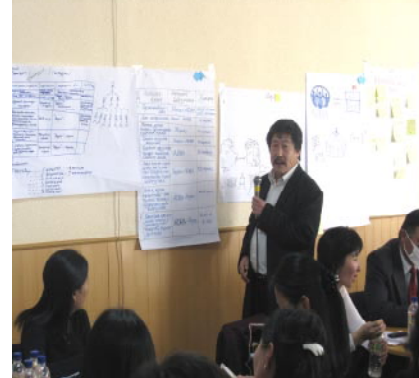
Winners of "Safe Choice" Debating competition