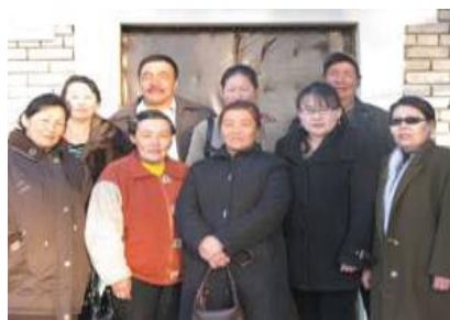
The Arvijih Self Help Group have recently opened a bath house

After the fall of communism, all services within the centre closed down or went out of business. The Arvijih SHG met with the Soum (county) Governor and agreed to rent eight small rooms and an