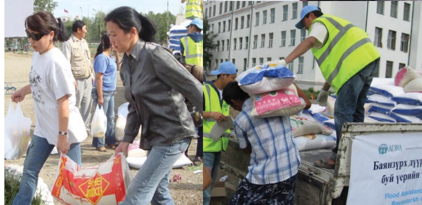
Food Relief: ADRA Mongolia responds to the recent floodings by distributing essential food items to those affected

The Bayanzurkh District local government assisted in the coordination and delivery of the response. ADRA Mongolia received response support from ADRA Internationals Emergency Management Bureau, ADRA Asia